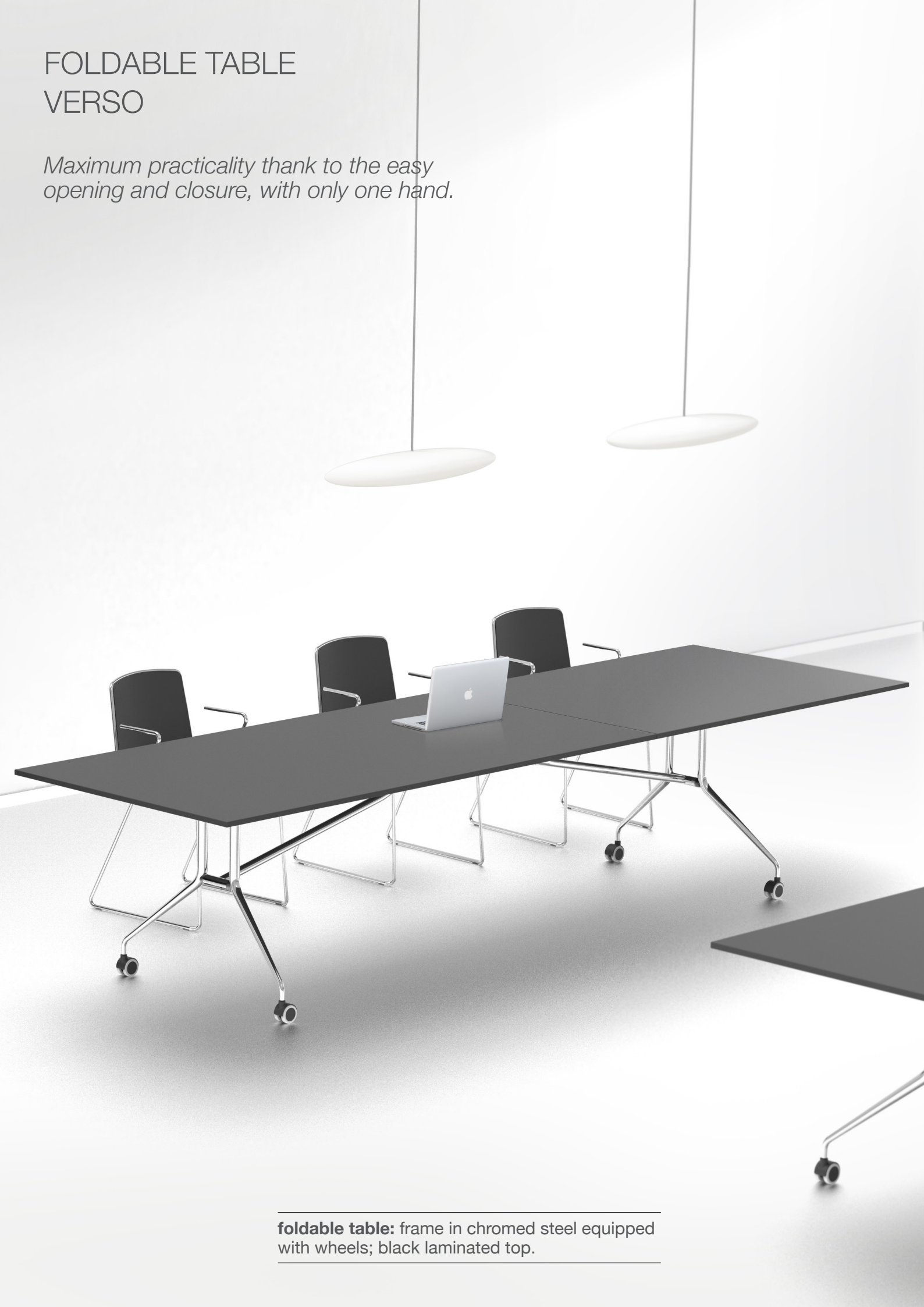
foldable table: frame in chromed steel equipped with wheels; black laminated top.

Maximum practicality thank to the easy opening and closure, with only one hand.